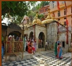
Mata Jawala Mukhi Baba Deot Sidh Garden

Hamirpur is surrounded by various famous temples such as Mata Jawalaji, Mata Chintpurni, Mata Bagula Mukhi, Mata Brajeshwari, Chamunda Devi, Baba Deotsidh and famous Tea Gardens etc.